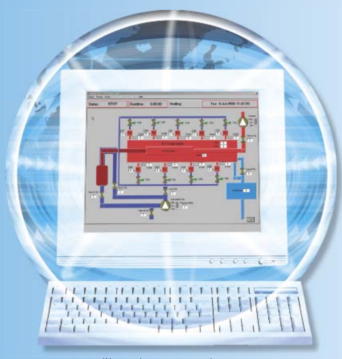
Kiln control system screen snapshot

Originally responsible for the innovation of equipment within Ferroxcube (formerly Philips Components), the EED is since many years also supplier of control and measurement systems to many other customers worldwide with a strong emphasis on quality , reliability and service .