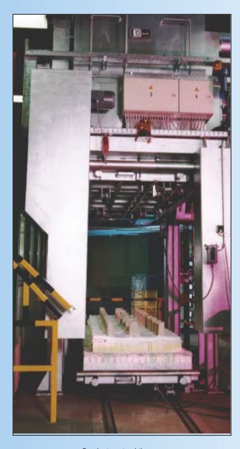
Batch sintering kiln