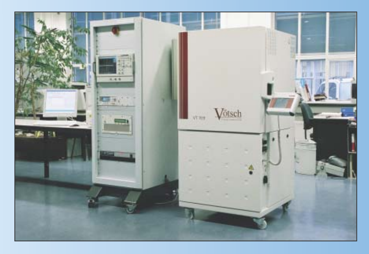
Powerloss measurement setup for ferrites

All projects are done in close co-operation with the customer